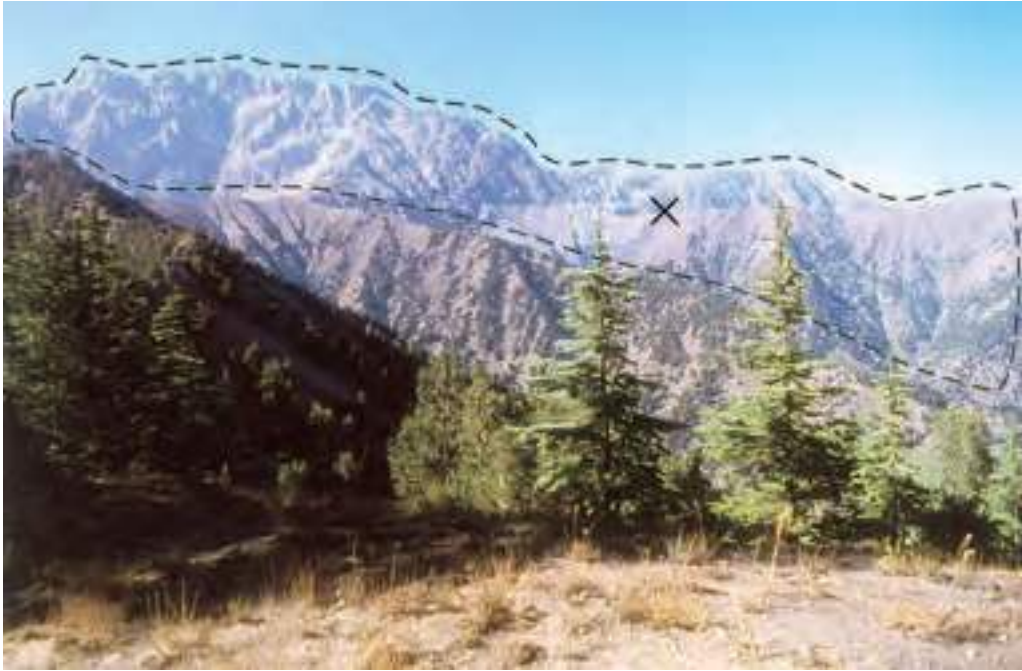
Chitral Gol National Park, Hindu Kush