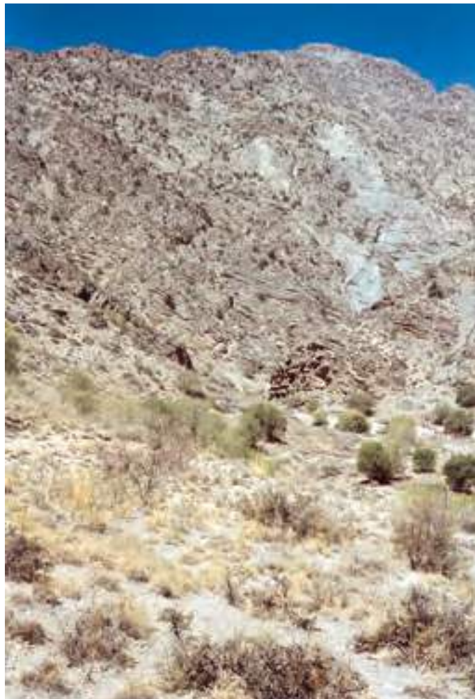
Hazarganji-Chiltan National Park, near Quetta